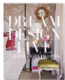
Dream Design Live By Paloma Contreras September 2018