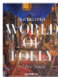
Gatekeeper: World of Folly By Hunt Slonem